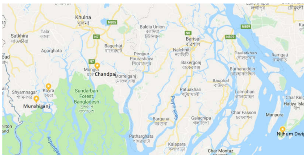
Figure 1 Field Sites: Khulna and Nijhum Dwip

Once the interviews, focus group discussions and surveys were completed, the data was transcribed, categorized, systematized and synthesized.