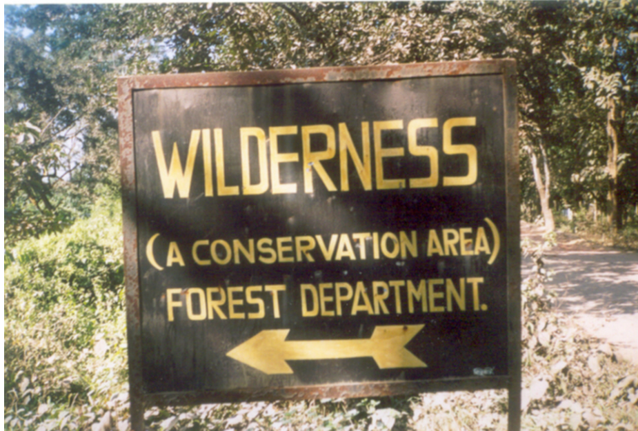
Photo 1 Starting point for the short/medium/long trail

Start from the main road about 100 meters east from Satchari Beat Office (BO). After reaching a signboard (WILDERNESS), turn right to find a Mini Jarul tree just behind the signboard (Photo 1). Walk along the trail, and you will encounter a wide (5 meters) stream, which is almost dry in the winter and so not difficult to cross as there is a very little flow of the stream from left to right. Enjoy lush green vegetation on both sides of the stream, notice at left bamboo as undergrowth.