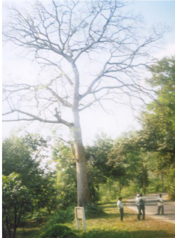
Photo 12: End point of the long trail, marked by a big Dumur (Fig) tree

Move forward to reach the main road near to border of NP and Chaklapunji Tea Estate. There is a big Dumur tree (Photo 12) at your left and a big signboard (of Agar plantations) near to the road. Get into your vehicle and reach the Forest Rest House at Satchari (about 2 km to the west) (Photo 13).