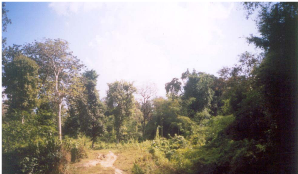
Photo 2: A partial view of the short trail, immediate after the stream at Satchari