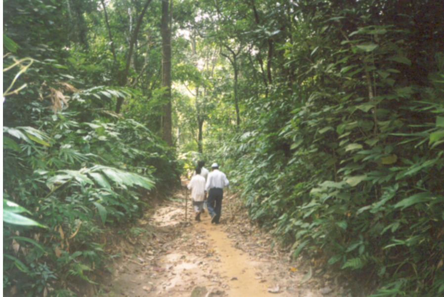
Photo 7: The trail passes through dense natural forest of Satchari

Go ahead, you will hit a bit wider trail (Photo 8) with sandy soil where you will have the feeling of walking on cool sands with beautiful forest canopies above and around you. Be careful about some of the spiders which are common in this place resting within their nets. Chasma honumans are frequently seen at this place.